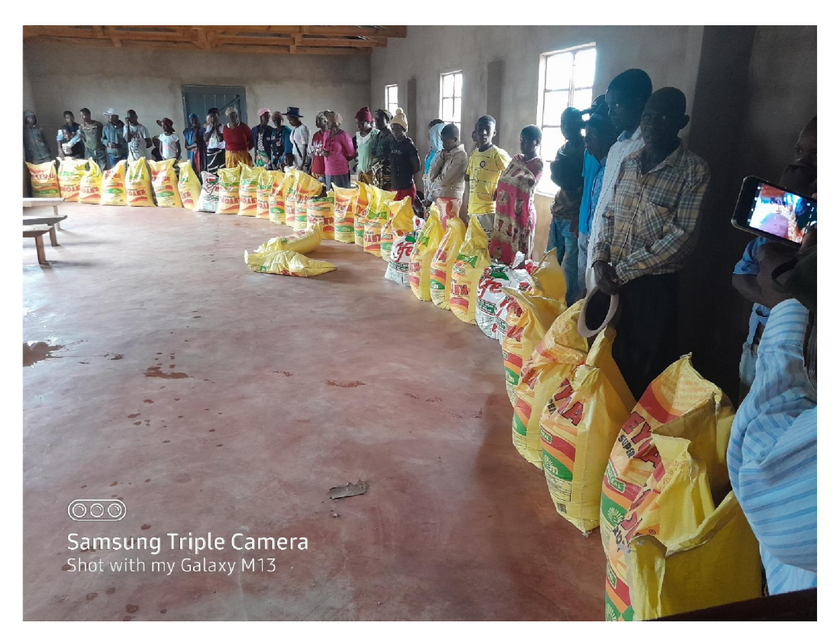
Immediately, we left to Bera 60 kilometres away. We offloaded first at Chenhare collection point, then at Bera and finally Ruware as shown by the following three pictures respectively.